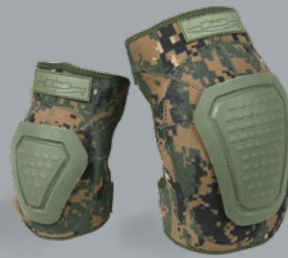
DNKP-DW/DNEP-DW (Digital Woodland Camo)