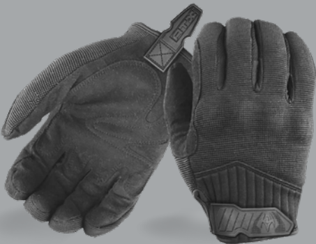
ATX65 UNLINED HYBRID DUTY GLOVES