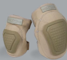
DNKP-T/DNEP-T (Coyote Tan)