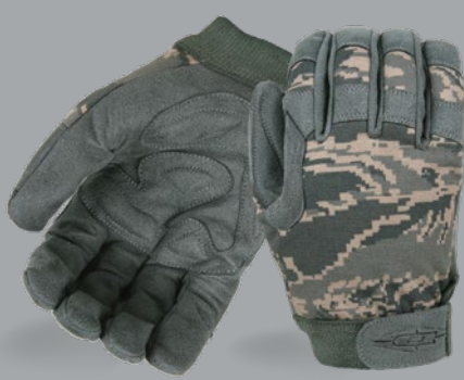
MX25-ABU (ABU Digital Camo)