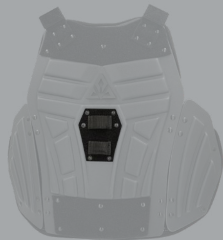
Shown on the PX6 Tactical Riot Suit