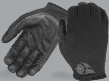
ATX5 LIGHTWEIGHT PATROL GLOVES