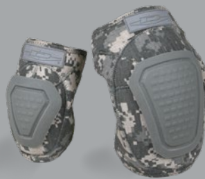
DNKP-A/DNEP-A (ACU Digital Camo)