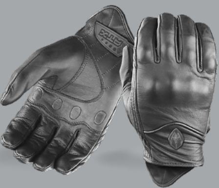
ATX95 ALL-LEATHER GLOVES W/ KNUCKLE ARMOR