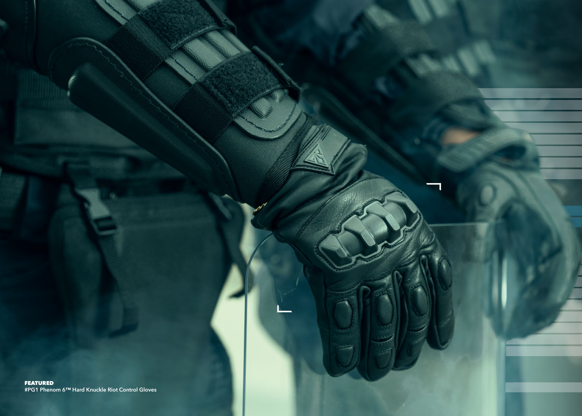
FEATURED #PG1 Phenom 6™ Hard Knuckle Riot Control Gloves