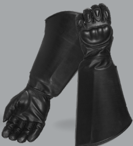
CRT300 VECTOR 3™ RIOT GAUNTLET WITH CARBON-TEK™ KNUCKLES