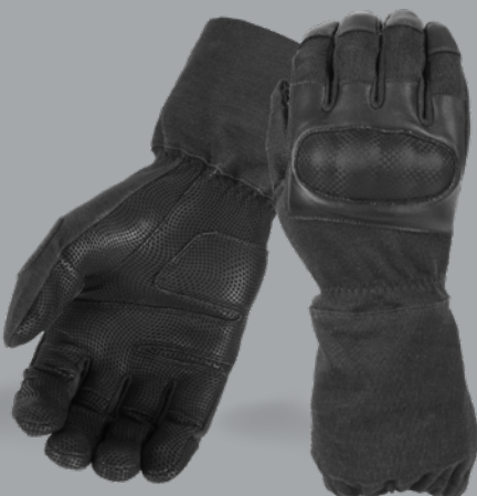
DS0150H-B SPECOPS™ TACTICAL GLOVES