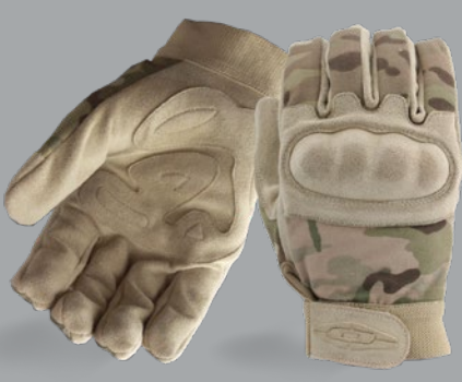
MX25-MH (MultiCam® Camo)