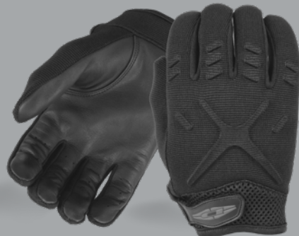
MX30-B INTERCEPTOR X™ MEDIUM WEIGHT DUTY GLOVES