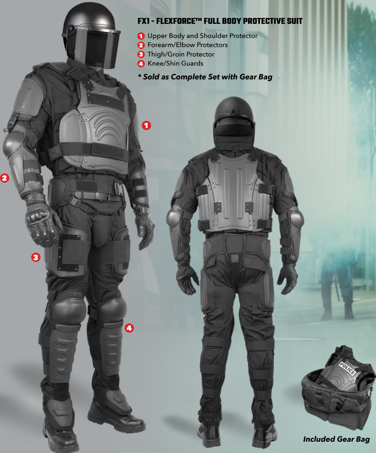
Included Gear Bag