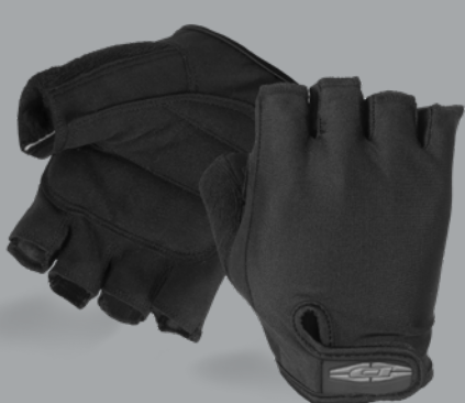
DC290 BIKE PATROL GLOVES (1/2 FINGER)