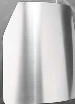
Aluminum Stab Plate Insert