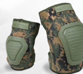
DNKP-DW/DNEP-DW (Digital Woodland Camo)