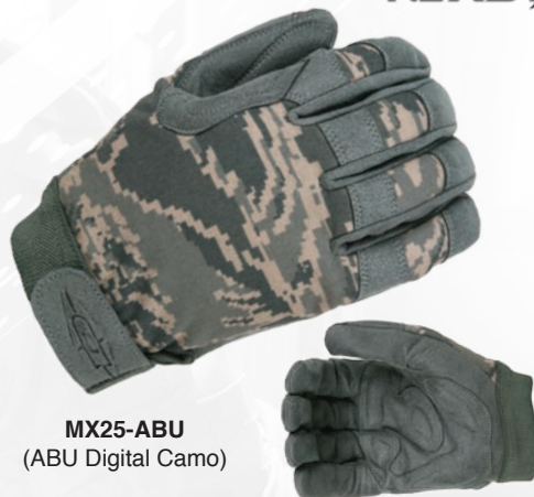
MX25-ABU (ABU Digital Camo)