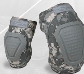
DNKP-A/DNEP-A (ACU Digital Camo)