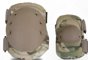
DKP-MC/DEP-MC (MultiCam® Camo)

Minimums & lead times apply on all "Made to Order" items and vary by style. Please inquire for specific quotes.