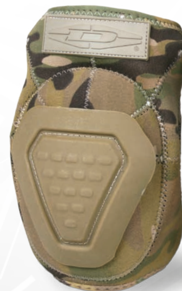
DNEP-M (MultiCam® Camo)