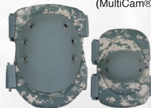
DKP-A/DEP-A (ACU Digital Camo)