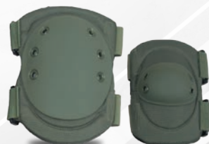
DKP-OD/DEP-OD (OD Green)