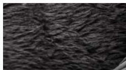
Faux Fur Inner Lining