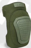
DNKP-OD (OD Green)