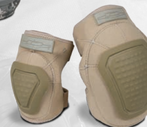
DNKP-T/DNEP-T (Coyote Tan)